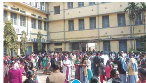
Fellowship after the Solemn Eucharistic Celebration at St. John Bosco Parish, Liluah, on 28 January, 2018