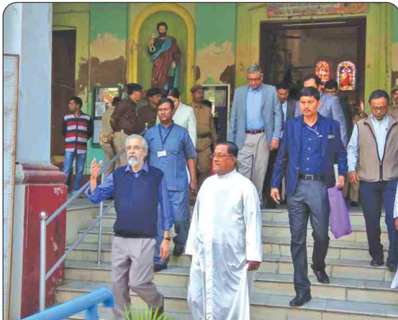
Justice of Supreme Court of India visits Sacred Heart Church, Chandannagore on 7 January, 2018