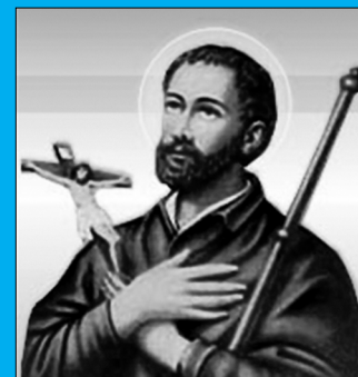
St. Francis Xavier Patron of Ranchi Archdiocese