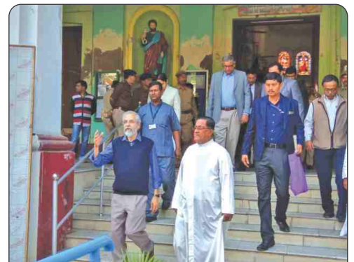
Justice of Supreme Court of India visits Sacred Heart Church, Chandannagore on 7 January, 2018